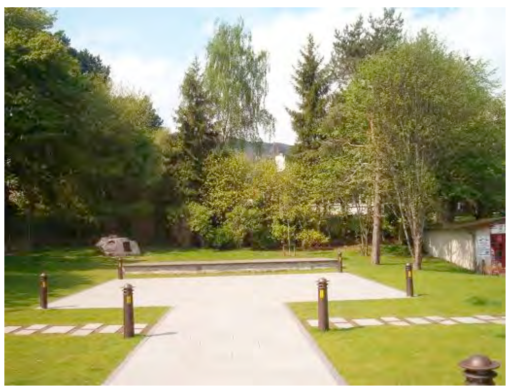
Fig 5 More recent photo showing changes to village green (Kila behind)