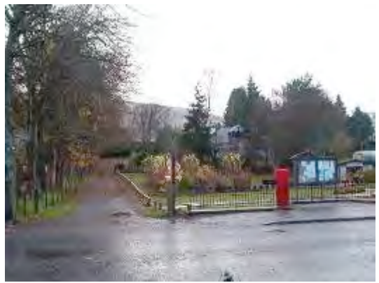
Fig 2 showing site access

١. The site for this application is a house known as 'Kila' to the rear of the village green on Grampian Road between the Cairngorm Hotel and a row of shops that join Tescos supermarket to the north. The site is located close (opposite) to the railway station. The site to be developed is partly screened from the village green by a line of trees.