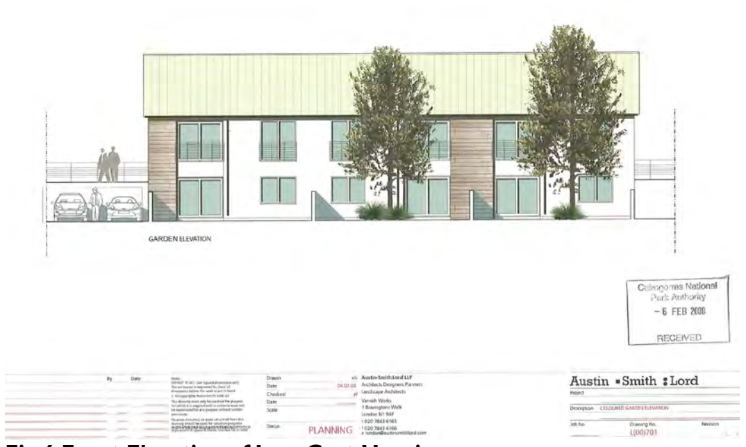
Fig 6 Front Elevation of Low Cost Housing

2. Kila is run by the existing occupant as a B & B. It is proposed that the house be demolished and replaced by 6 flats. Access would follow the same route as existing along a tree-lined track bordering the Cairngorm Hotel. The site has outline planning permission for the 6 flats granted by the CNPA in 2006, subject to a range of conditions including more information on the affordable